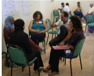
Tamra-Mitzpe Aviv dialogue workshop

and landscape design project for the neighboring communities.